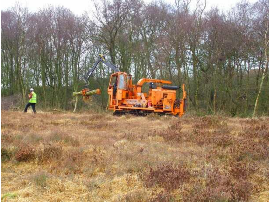
Clearance of scrub woodland at Heysham Moss.