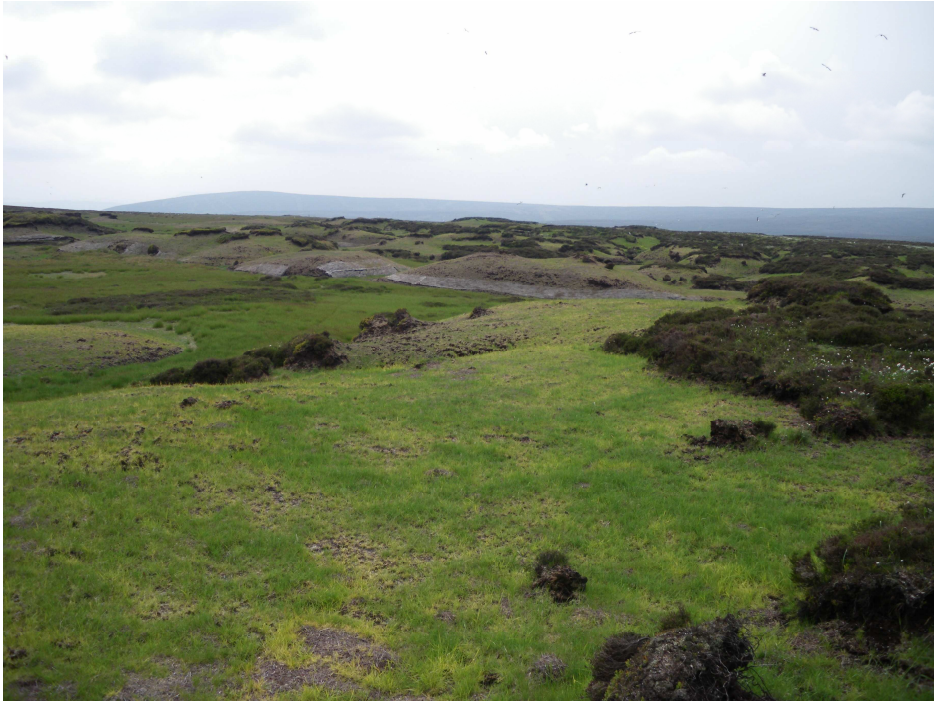
Re-vegetation of bare peat with "nurse-crop" at Langden Head.