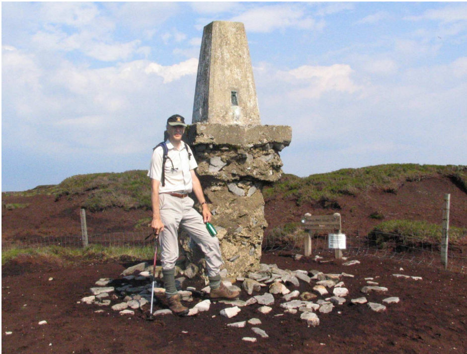
Bare peat on Langden Head, illustrating extent and nature of erosion.