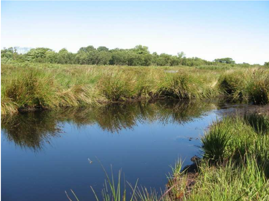
Bog pools forming behind installed bunds at Heysham Moss.