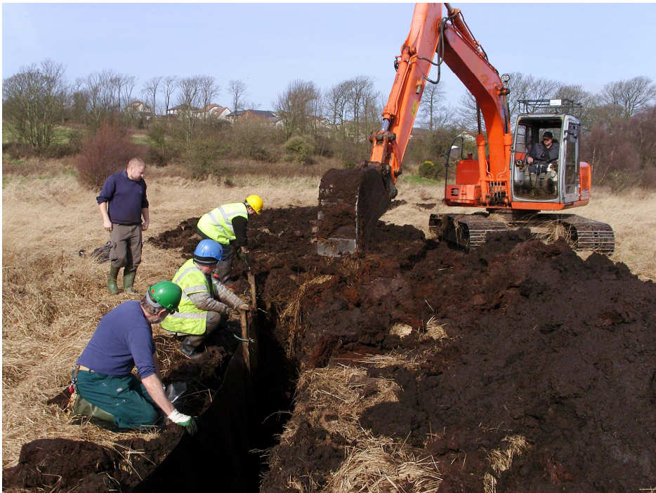
Installation of polygene sheeting at Heysham Moss.