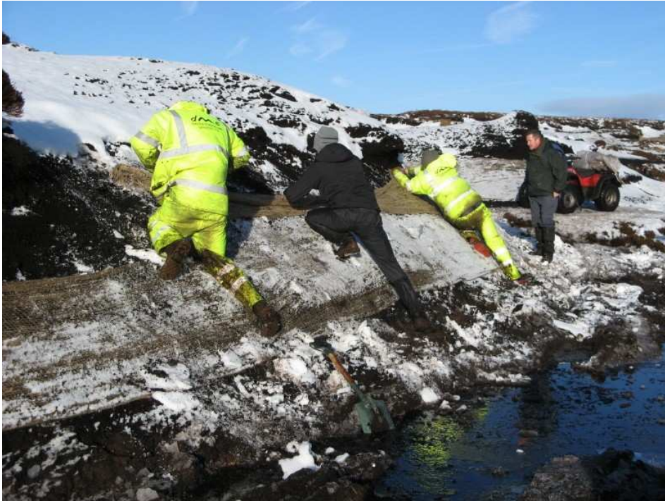
Geo-textile being installed at Langden Head on steeper slopes of bare peat to promote re-vegetation.