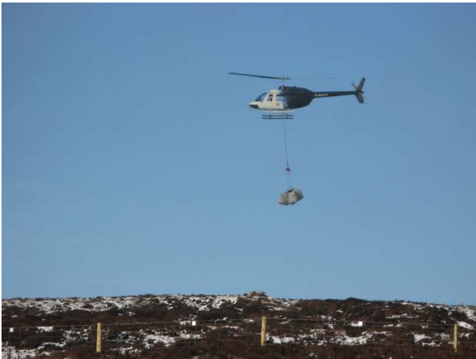
Heather brush being lifted on to project site at Langden Head