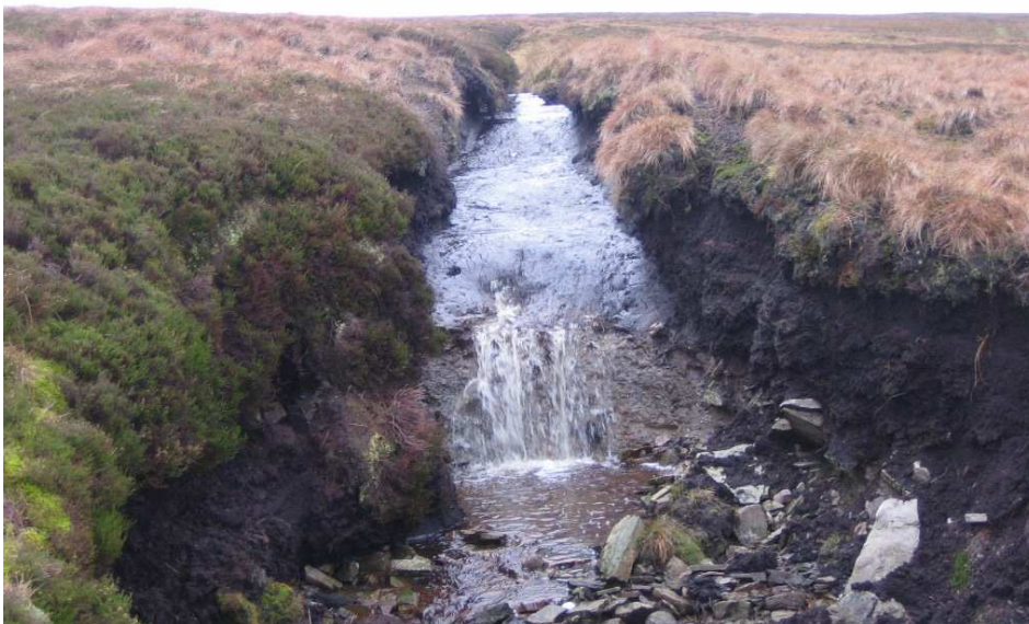
Eroding moorland grip, showing how peat is lost and habitat degraded.